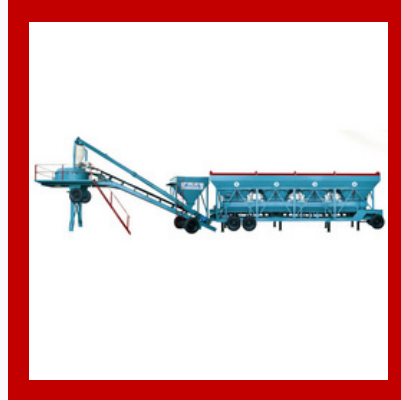
Mobile Concrete Plant