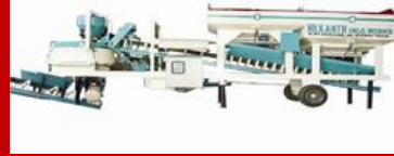
Concrete Batching Plant