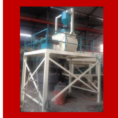
Twin Shaft Mixer