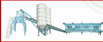
Stationary Concrete Batching Plant -60 Cu