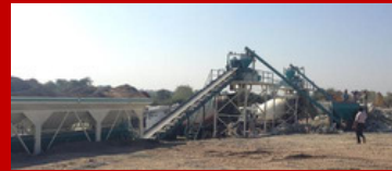
Stationary Concrete Batching Plant -30u