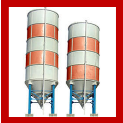
Cement Storage Silo