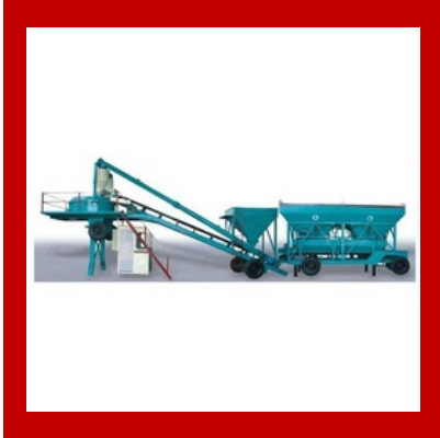
30 Cu Concrete Batching Plant