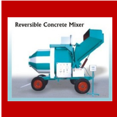
Concrete Mixer for Bridge Construction