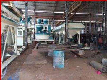
Concrete Batching Mixer