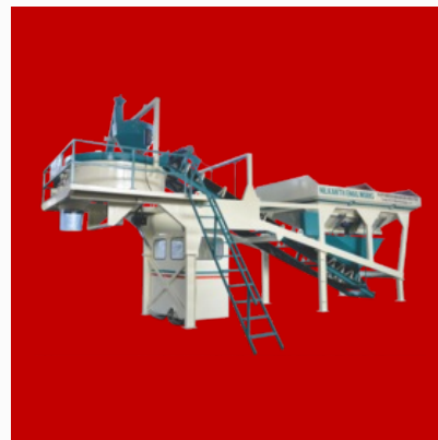
Compact Concrete Plant