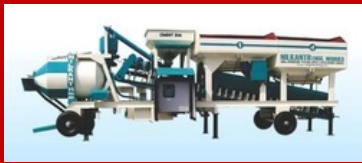
Mobile Concrete Batching Plant 18 Cu M per Hrs