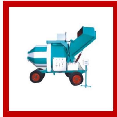
Reversible Concrete Mixer