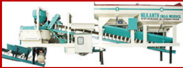
Stationary Concrete Batching Plant-25cu