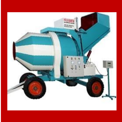
Reversible Concrete Mixer Machine