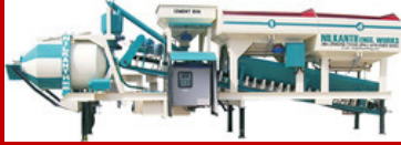
Stationary Concrete Batching Plant