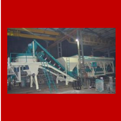
Concrete Batch Mix Plant