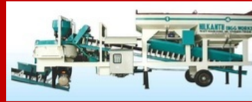
Mobile Concrete Batching Plant 30 Cu M per Hrs