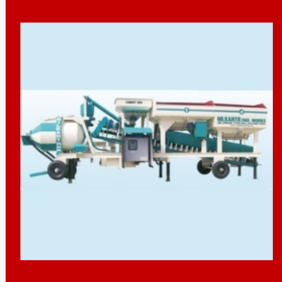
Concrete Batching Plant