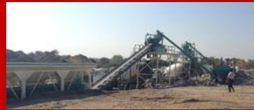
Stationary Concrete Batching Plant