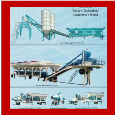
Concrete Mixer Equipment