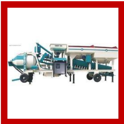
Drum Mix Plant