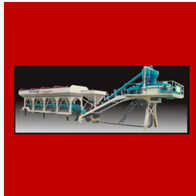
Stationary Concrete Batching Plant -45 Cu