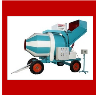
Concrete Mixer for Canal Construction