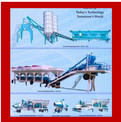
Mobile Concrete Plant