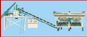
Twin Shaft Concrete Batching Plant