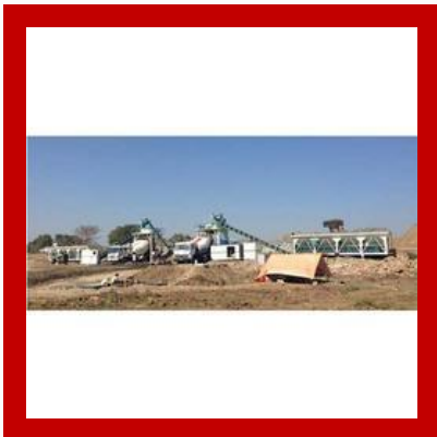
Pan Type Mobile Concrete Batching Plant