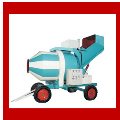
Mobile Concrete Mixer