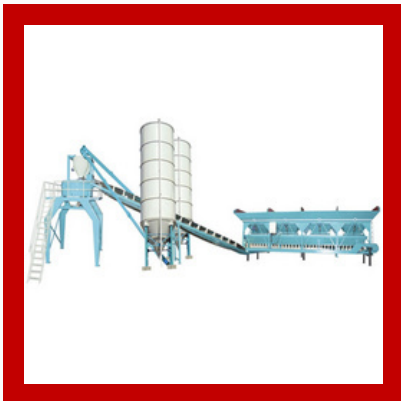
Concrete Batch Plant