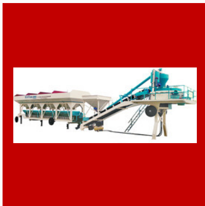
Ready Mix Concrete Machine