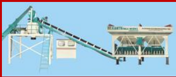
Twin Shaft Concrete Plant