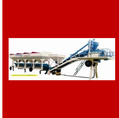
30 Cu Concrete Batching Plant