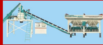
Stationary Concrete Batching Plant -20 Cu