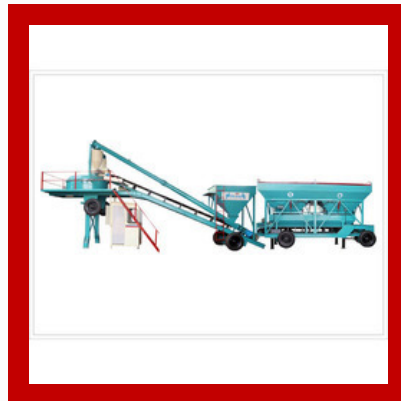
Compact Concrete Batching Mixer