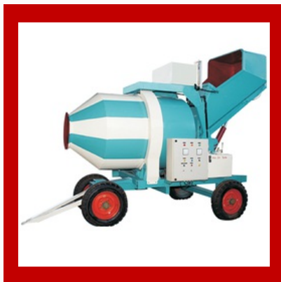
Concrete Mixer for Building Construction