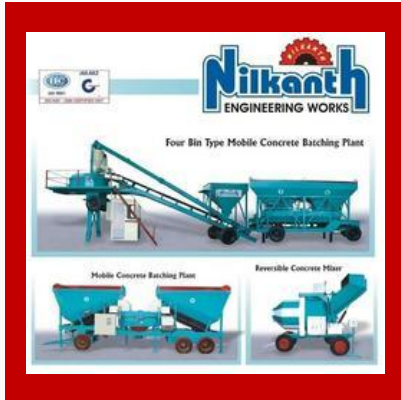
Construction Concrete Batching Plants