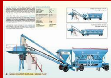
Mobile Concrete Batching Plant